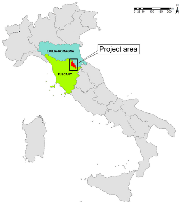
Fig. 1 - Study area. The location of the Parco Nazionale delle Foreste Casentinesi, Monte Falterona e Campigna where the LIFE project WetFlyAmphibia is implemented.

creation of new breeding areas; 2) amelioration of the conservation status of E. quadripunctaria and E. catax populations, through the improvement of the conservation status of their habitats; 3) improvement of the conservation status of open wetlands (habitat 6430) and rare or unique plant species related to these habitats; 4) increment of the awareness of local people about the need of conservation of amphibians and butterflies species.